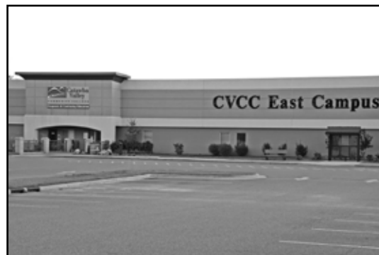
CVCC East Campus